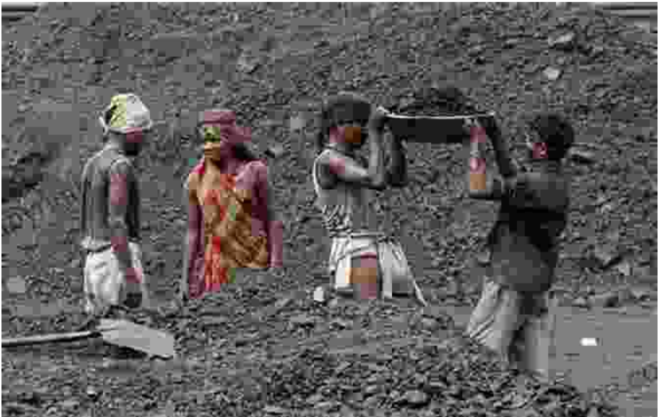
A coal miner in Sonbhadra, India.