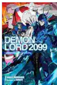
Image 8: A group of cybernetic demons engage in a fierce battle against a team of human rebels.

Image 7: The skyline of the futuristic city, showcasing towering skyscrapers and neon lights.