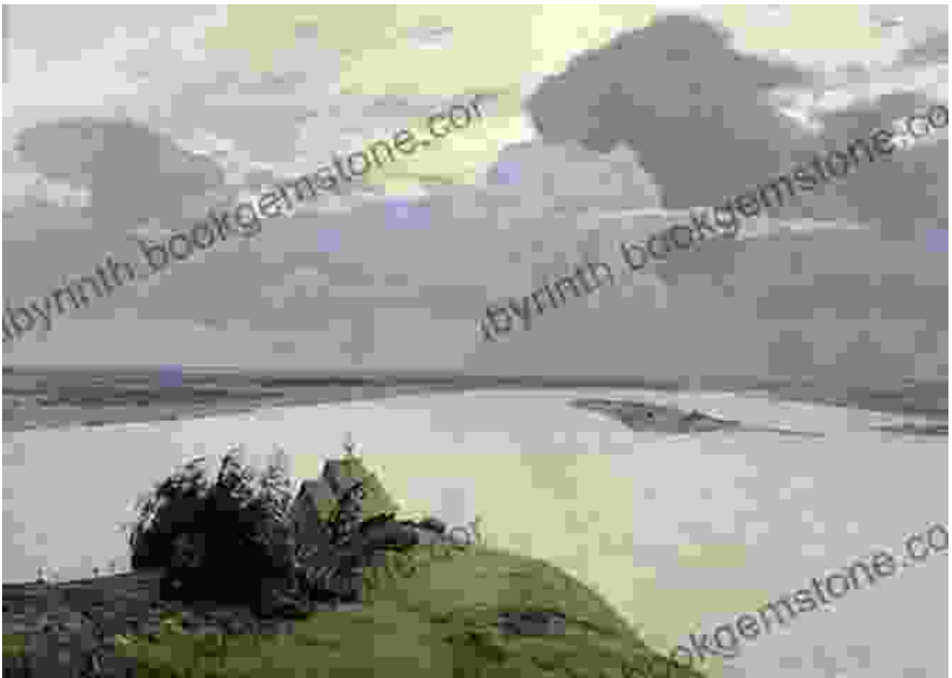
Isaac Levitan, Above Eternal Peace (1894)

Through Irving's descriptions, readers can almost feel the cool breeze blowing through Levitan's birch forests, hear the gentle lapping of waves on the shores of his lakes, and smell the sweet scent of wildflowers blooming in his meadows.